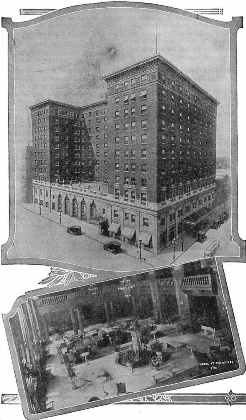
Hotel Fort Des Moines, and Main Lobby, where the Convention of the AMERICAN PHARMACEUTICAL ASSOCIATION and bodies meeting with them will be held.